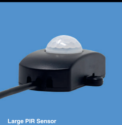
Large PIR Sensor