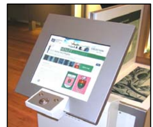
Track Ball Kiosk